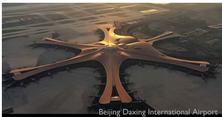
Beijing Daxing International Airport

"We have pursued a more proactive strategy of opening up. We have worked to build a globally oriented network of high-standard free trade areas and accelerated the development of pilot free trade zones and the Hainan Free Trade Port. As a collaborative endeavor, the Belt and Road Initiative has been welcomed in the international community both as a public good and a cooperative platform. China has become a major trading partner for more than 140 countries and regions. It leads the world in total volume of trade in goods, and it is a major destination for global investment and a leading country in outbound investment. Through these efforts, we have advanced a broader agenda of opening-up across more areas and in greater depth."